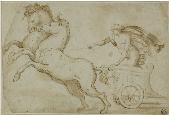
Del Vaga, P. Apollo Driving the Chariot of the Sun [Photograph]. Art Institute of Chicago. https://www.artic.edu/artworks/82070/apollo-driving-the-chariot-of-the-sun

When the Ancient Romans crossed the channel from Europe to Britain in the first century, their goal was to take over. They brought an army complete with chariots. As the chariots crossed Britain, they left ruts across the countryside, creating roads. After the Romans left, the English made wagon wheels the same distance apart as on the Roman chariot. This allowed them to continue using the roads (and ruts) without breaking wheels and axles on their wagons.