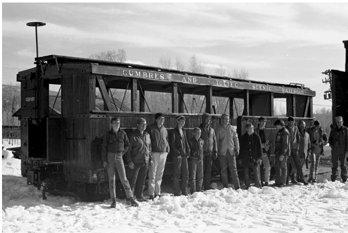
Early volunteers pose with a converted passenger car they had been building.

In 1970, the states of Colorado and New Mexico bought what is now the Cumbres & Toltec Scenic Railroad. Volunteers came together to rebuild the track and move equipment to its new home in Chama, New Mexico. When the states bought the line, many of the structures and pieces of rolling stock had not been used in many years and were in poor condition.