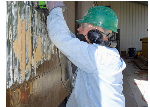
A volunteer prepares Railway Post Office Car 54 for a new paint job in 2024.

Since 1980, our organization has grown to roughly 2,000 members. We host approximately seven week-long work sessions, Monday - Friday, on the Cumbres & Toltec Scenic Railroad. Volunteers come from around the world to help restore rolling stock and lineside structures and to preserve and interpret railroad history. In addition to on-site volunteer work sessions, we have volunteers who work remotely to plan and create interpretive signs and exhibits, and to create educational materials.