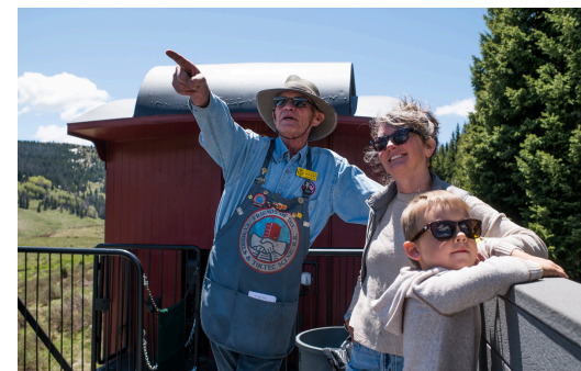
A docent points out sights to passengers in the open-air gondola.

Docents can also give tours of the railyard in Chama or Antonito and teach you about the historic structures and equipment you see.