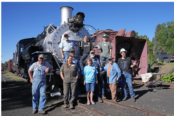
The 2023 483 Cosmetic Restoration Team poses for a photo.

Volunteers ages 10+ can also help the Friends of the Cumbres & Toltec Scenic Railroad during work sessions. For young people wanting to volunteer, please reach out to our Project Coordinators, listed on our website, to find the best fit. We would love to work with you!