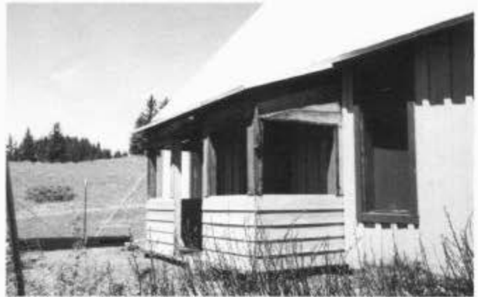
The east porch of the car inspector's house at Cumbres. Volunteers removed the entire porch and then rebuilt it using original materials wherever possible. The porch is now ready for painting.