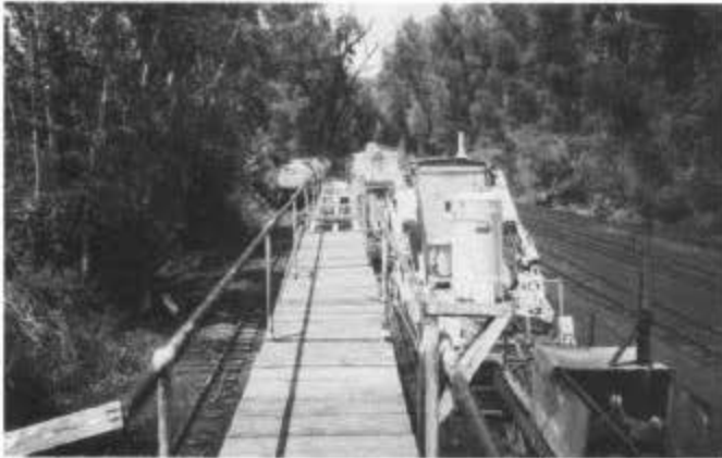
The lower part of the oil dock at Chama was scraped and painted. Aluminum roof coating did a good job in covering the tar that had accumulated over the years on the metal piping. The crew began building a new wooden walkway, and as seen in the photograph, they made a good start.