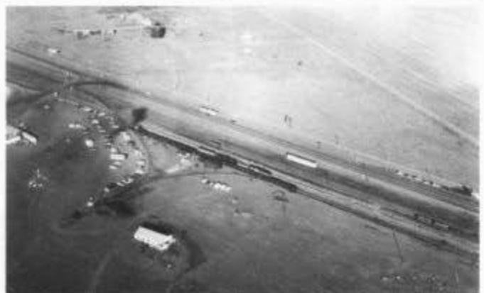
Aerial view of the C&TS wye at Antonito in 1971, looking northwest. A passenger train is at the new depot; a standard-gauge passenger car is parked near the end of D&RGW track; and Highway 17 is beyond the passenger car. The parking lot is to the left. Part of the Narrow Gauge Motel is at the far left.