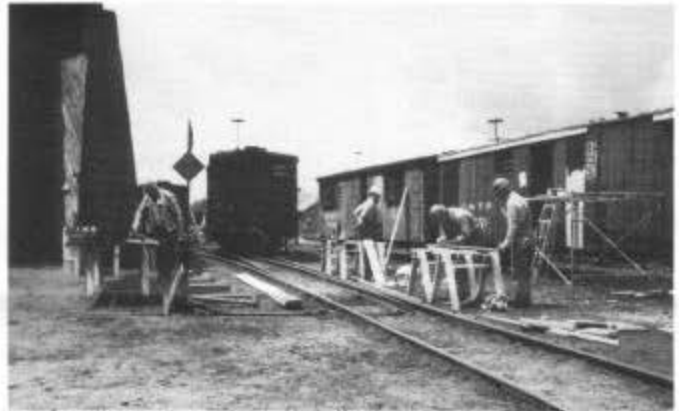
Both interior and exterior work continued from summer 1991 on bunk cars nos. 04258, 04407, and 04982, parked in the Chama yard. In addition to roof and siding work, the crew completed much of the interior work, such as laying and sealing the floors and painting.