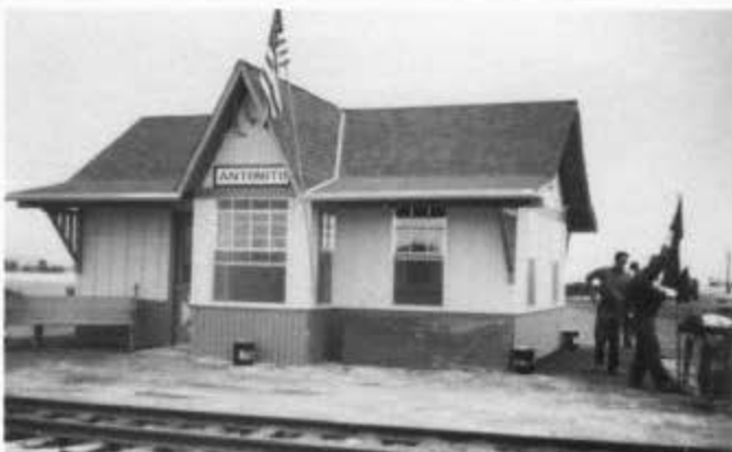
The Antonito depot shortly after completion. The building is now the office of the Cumbres & Toltec Scenic Railroad Commission. June 26, 1971.