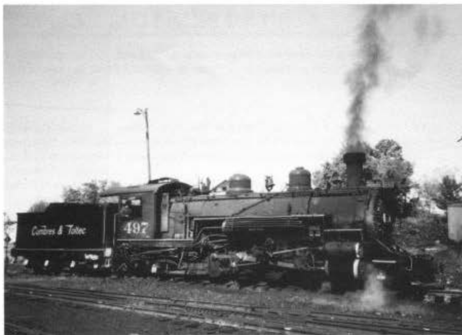
K-37 class locomotive no. 497 in Chama yard, June 11, 1992.

October 11, Sunday End of season on the C&TS