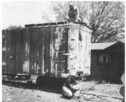
At Chama the 30-foot (short) refrigerator car no. 55 was cleaned, and the car is now ready for repairs. Replacement hardware collected from derelict cars in the east meadow included brake system parts, queen posts, coupler lift bars, and stirrup steps.