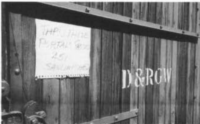
A tribute on the Friends' Club Car door to the lunch preparation crew, Sunday morning, June 14, 1992.