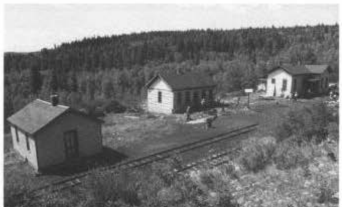
At the end of the work session, the shingle bunk house (left) at Sublette had a new asphalt shingle roof. Volunteers removed the old concrete chinking from the log bunk house (middle). New mortar mix will prevent moisture penetrating into the chinks. The log bunk house also has a new asphalt shingle roof. The section house is shown at right.