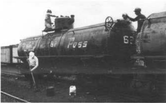
The six tank cars that the Friends purchased from the White Pass & Yukon are parked at the north end of the Chama yard. They were scraped and painted with red steel primer. Here, the crew is working on car no. 62.