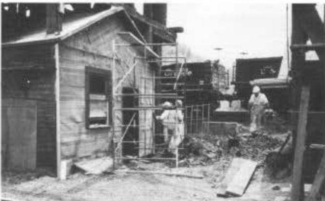
Work began on the coal tipple at Chama. Here, the crew is installing roofing paper on the south wall (the same type of material found on the north wall) of the machinery room after having removed the old and worn-out siding. Some of the old siding was used to repair the north wall.