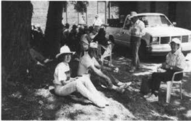
The social lunch in the Chama yard for volunteers and their families on Saturday, the last day of the work session, was enjoyed by more than 100 persons.