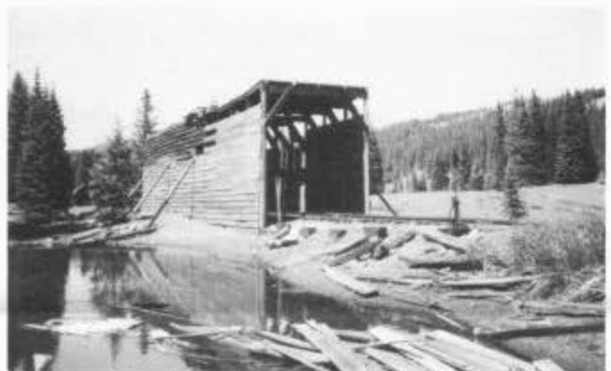
The crew continued the ongoing work of replacing boards and battens on the sides of the snowshed at Cumbres. Several broken beams in the roof were secured, and three bays were cleared of scrap wood in preparation for roofing at the July/August work session.