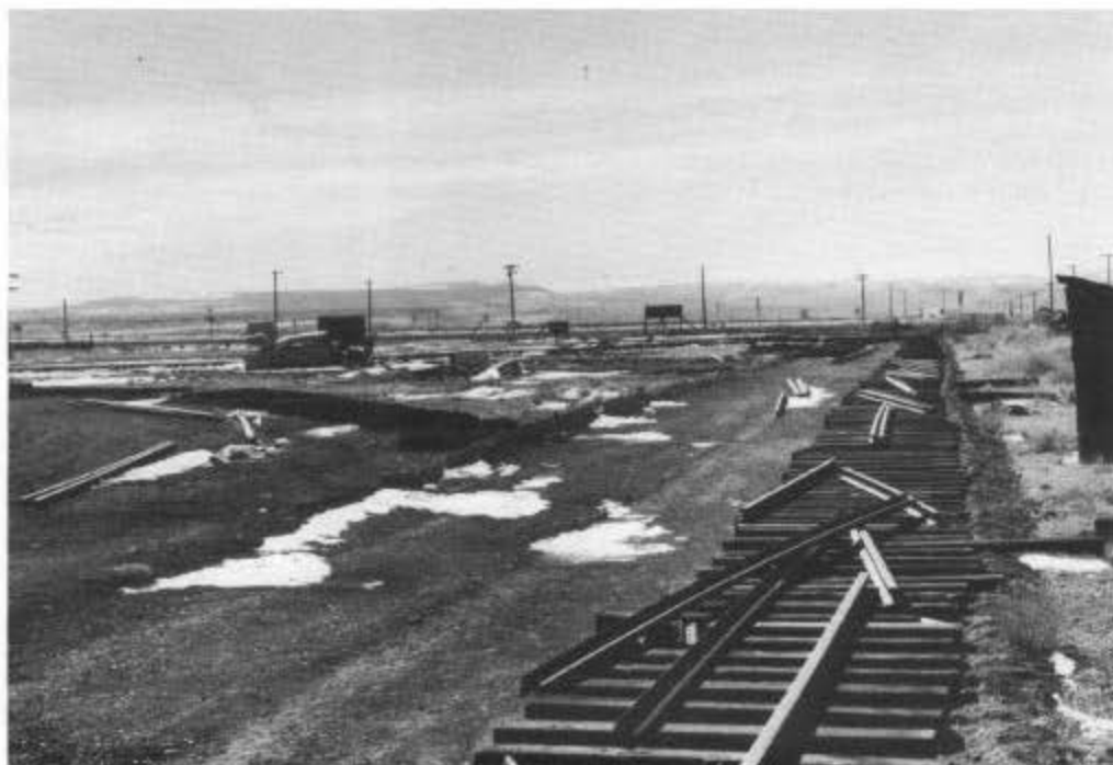
The C&TS wye at Antonito under construction, looking southwest. February 12, 1971.