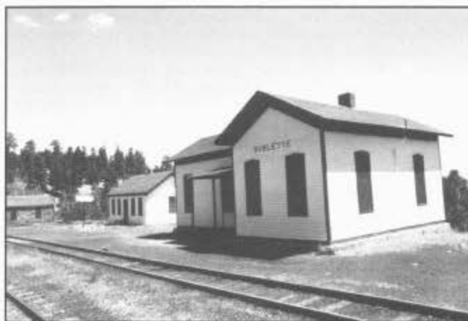
At Sublette the section house and log bunk house were painted. Note the lettering on the north side of the section house. The shingle bunk house is in the background. August 1993.