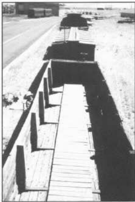
New flooring and side stakes were installed in the display train gondola at Antonito. July 1993.