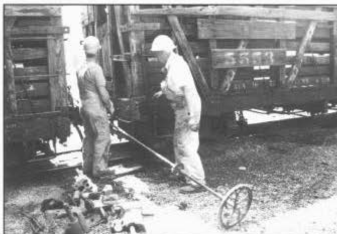
At Chama the brake rigging was reattached to one of the double-deck sheep stock cars donated to the railroad by the Friends. The brake linkage was disconnected years ago when the car bodies were separated from their trucks. July 1993.