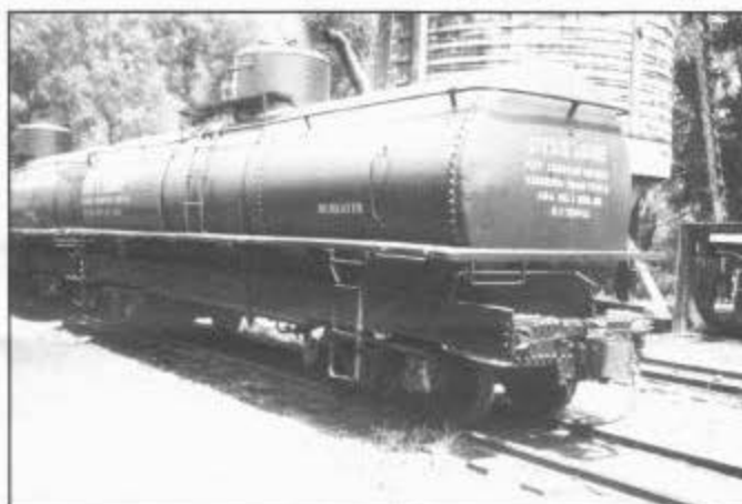
At Chama tank car no. 12962, and the other five narrow-frame tank cars donated to the C&TS by the Friends, was lettered in historically correct style. August 1993.