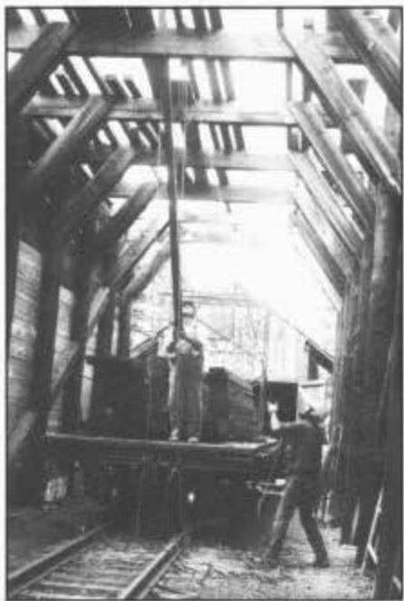
At the Cumbres snowshed, a block and tackle was used to raise decking material from the flat car to the roof. July 1993.