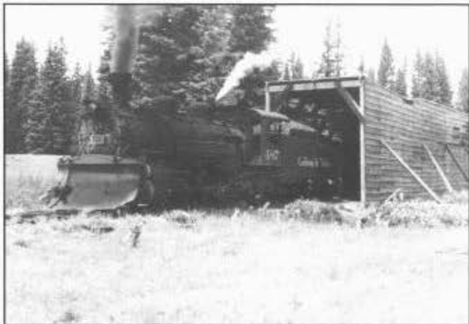
Engine no. 487 pulls a flatcar with tools and unused construction materials from under the Cumbres snowshed at the end of the work sessions. Note completed siding on the east side of the snowshed. August 1993.