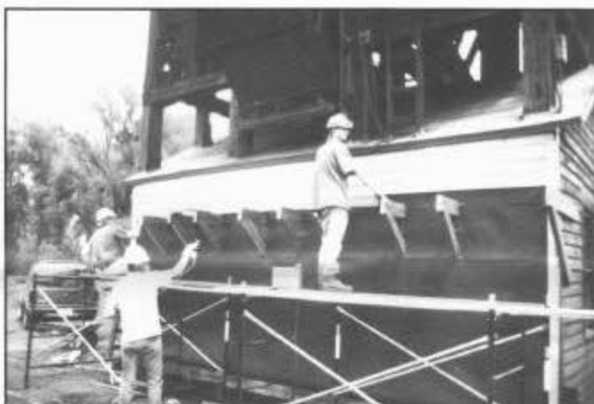
In the Chama yard new siding was placed on the west wall of the coal tippie machinery room. July 1993.