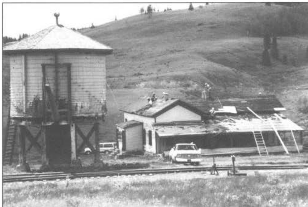
This was the first summer that a Friends crew worked at Osier. Volunteers are removing old shingles from the section house roof in preparation for installing roofing paper as temporary protection over the winter. July 1993.