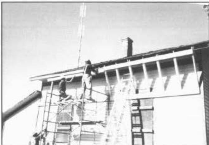
Installing temporary knee braces on the east side of the section house at Cumbres to support the roof and eaves, which were collapsing because of the winter snow load. August 1993.