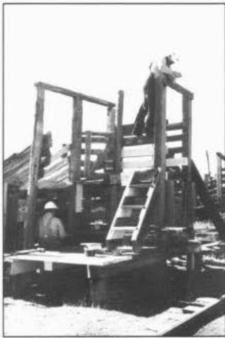
Repairs were made to the landings, ladders, and loading chutes of the stock pens at the south end of the Chama yard. August 1993.