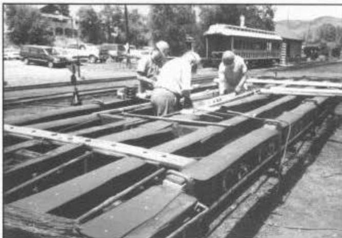
Working on the new floor for a flat car at Chama. In the background a crew from Hollywood is remodeling the Hinman coach for "The Legend of Wyatt Earp." August 1993.