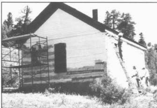
Painting the log bunk house at Sublette. July 1993.