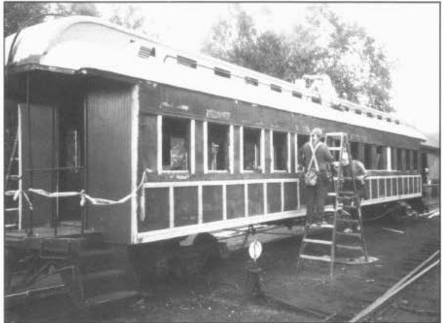
The Hinman coach being remodeled in the Chama yard by a film crew for "The Legend of Wyatt Earp," which will star Kevin Costner. A future issue of the C&TS Dispatch will have a full report of the filming activities this summer on the railroad. August 4, 1993.