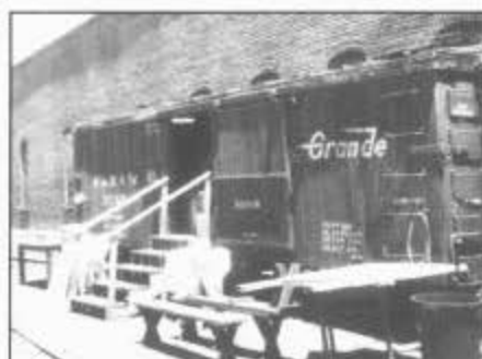
The food service car (D&RGW boxcar no. 3585) shown here at the end of the August 1990 volunteer work session, is parked in the Chama yard next to the original roundhouse.