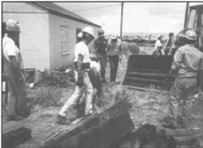
Before the track laying project could get under way at Antonito, the area had to be cleaned up. Here volunteers sort valuable parts to be transported to Chama and trash items no longer needed, July 20, 1994.