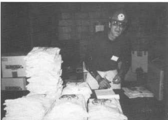
Major work was undertaken both inside and out on the new Friends Railroad History Center in Chama. Here inventory of some of our merchandise is taken following excellent sales at the Annual Meeting and on the Moonlight Train, July 25, 1994.