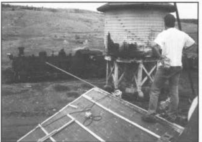
All work stops on the Osier Section House roof when the Chama-bound train pulls out of Osier station after its lunch stop, July 22, 1994.