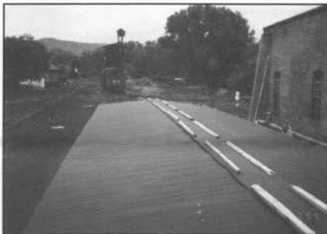
By the end of the second work session, hard-working crews were able to finish a second stock car roof in the form of sheep car no. 5633, July 27, 1994.