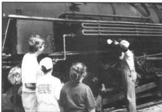
Creating memories in the Chama yard, July 24, 1994.