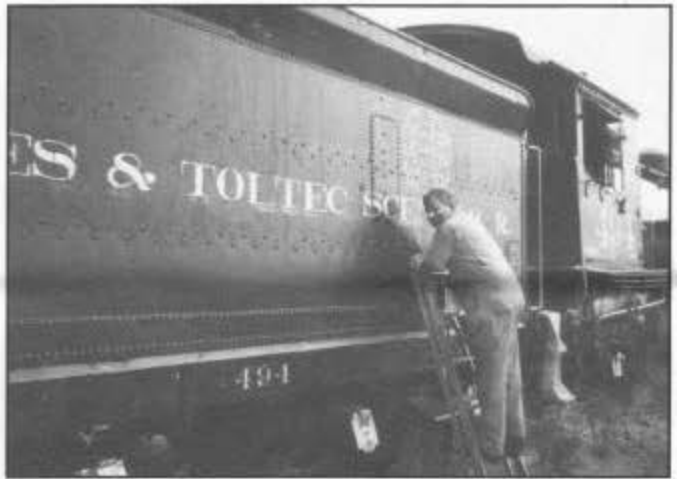
Several lettering projects were completed in Antonito including detailed lettering on engine no. 494 which had been painted in 1992, July 25, 1994.