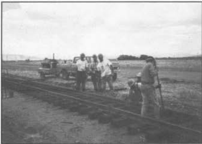
Volunteer crew members look on as final adjustments are made before spiking down the second rail on the new RIP track in Antonito, July 21, 1994.