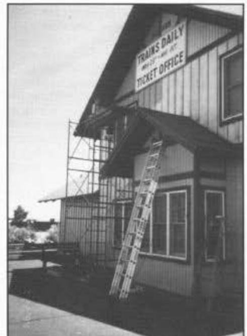
Progress on painting the Antonito Station at the end of the first work session, July 22, 1994.