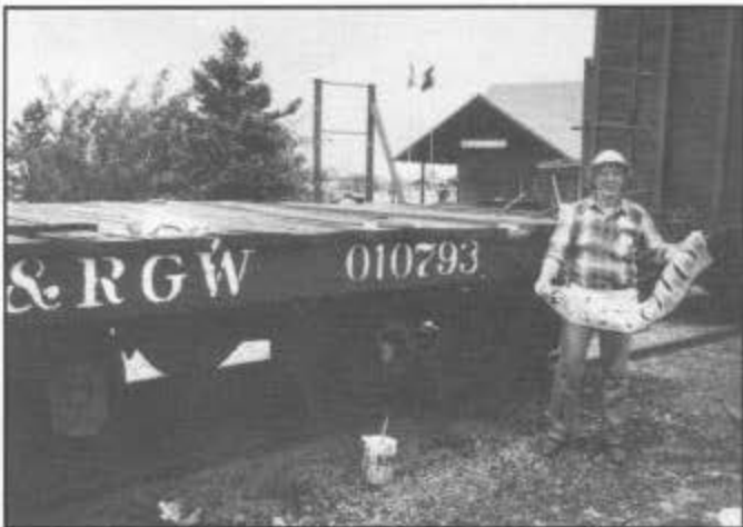
Standard gauge idler car no. 010793 on the dual gauge display track receives its lettering, July 25, 1994.