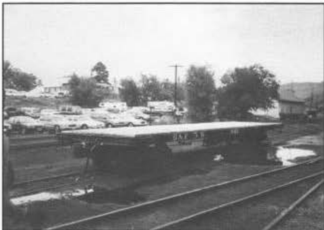
Work on the second steel flat car no. 601 has been completed and linseed oiled at the end of the work session, July 27, 1994.