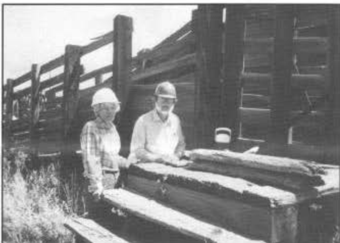
Much work was completed on the stock pens this year. Survey activity for future work was also a major activity. Shown here are members of the Survey crew preparing for next year's work projects, July 25, 1994.