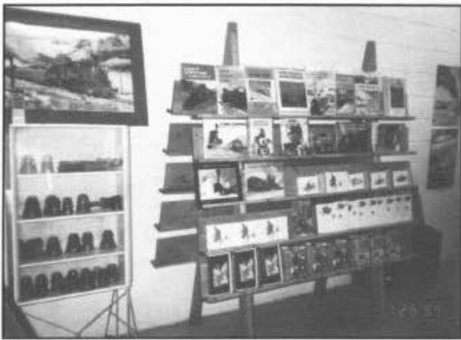
In the public part of the Railroad History Center, shelves were built to display our books and merchandise. Shown on the left is a collection of insulators, and one of several paintings on display, July 25, 1994.