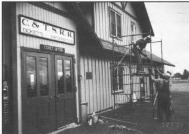
Taking down the scaffolding after completion of the paint job showing the south side of the Antonito Station, July 27, 1994.

Those famous words of an ancient Greek, “Neither snow nor rain nor gloom of night stays these couriers from the swift completion of their appointed rounds” — we could also say — the iron wheel on the iron rail hastened or sped them on “the swift completion of their appointed rounds.” Thank you.