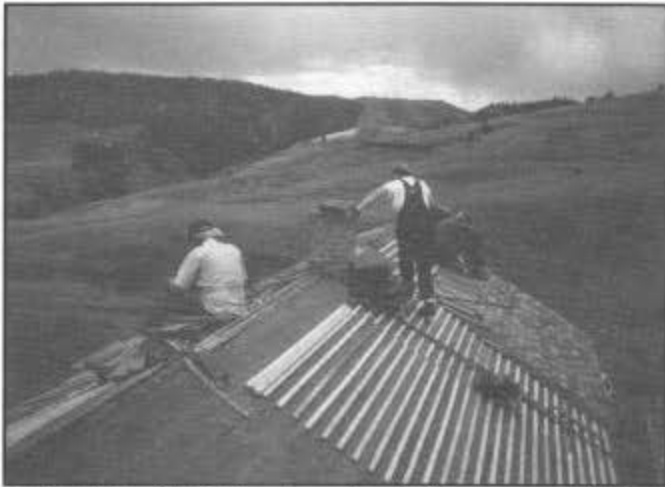
By the last day of the first work session, significant progress had been made on the shingles on the Osier section house roof, July 22 1994.