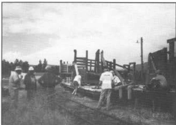
A large crew working on the stock pens at the South end of the Chama yard was cleaning up at the end of the work session, July 27, 1994.