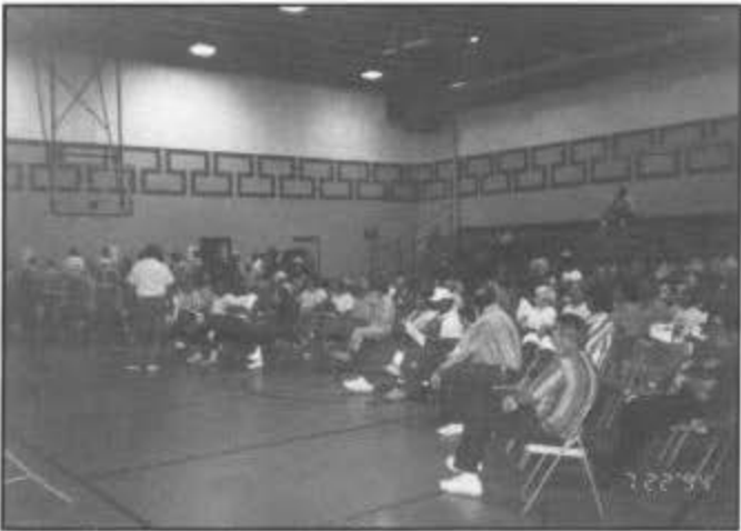
Annual meeting at Chama Valley School Gymnasium, Friday, July 22, 1994, with almost 200 people in attendance.