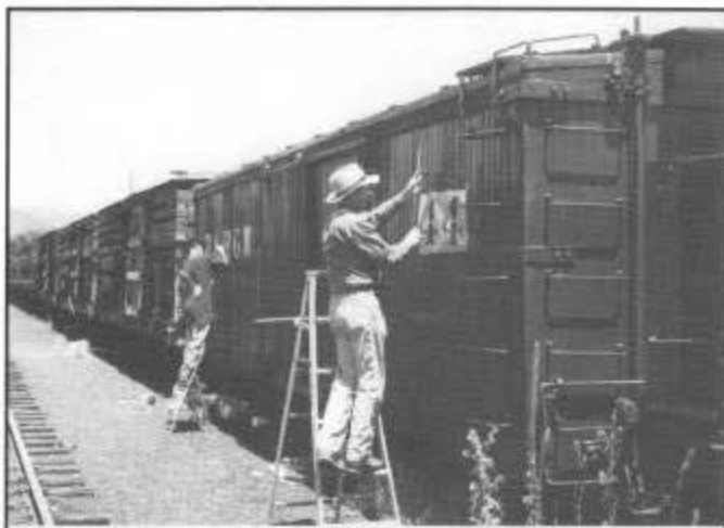
Lettering boxcar 4444 in the Chama yard, July 21, 1994.