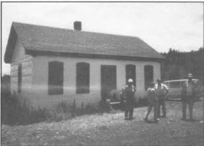
Volunteers standing in front of fully restored log bunk house at Sublette completed last year, July 20, 1994.