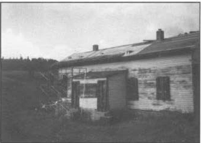
Last year the Osier Section house was stripped of the old layers of shingles and heavy felt paper was put down. This year the beginning of the job saw furring strips placed and wood shingles started, July 20, 1994.