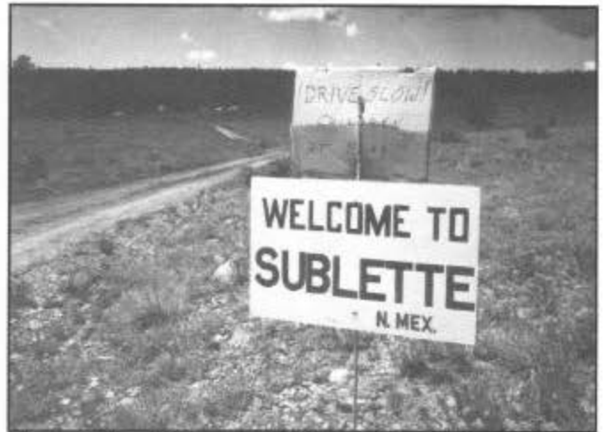
The population of ghost town of Sublette mushroomed during the work sessions. Some unknown (?) prankster added "Drive Slow! Children at Play!!" to the sign "Welcome to Sublette, N.Mex.," July 22, 1994.