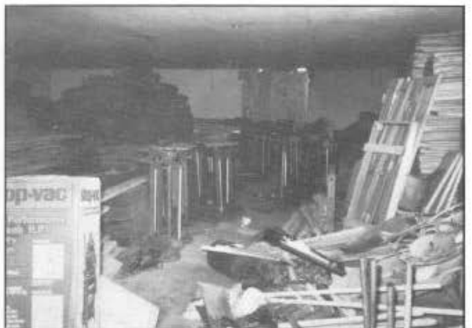
At Antonito, the crowded interior of Fort Knox is shown here before Friends volunteers started work to clean it up and make it into a shop facility for Friends' restoration work, July 22, 1994.