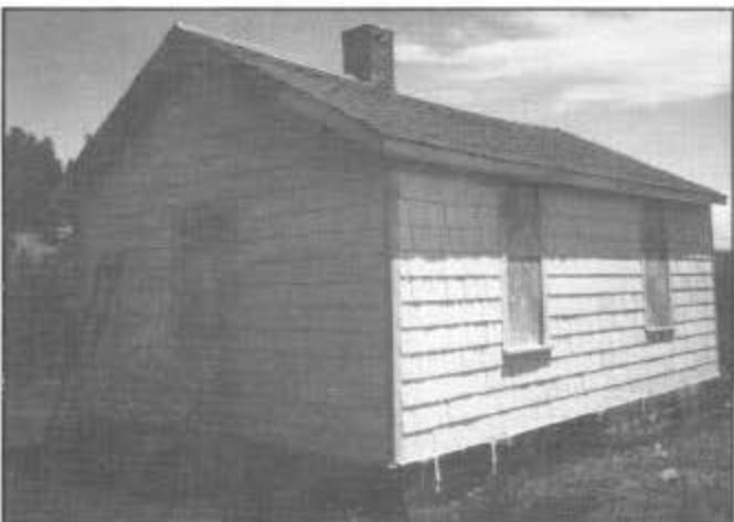
Painting in the historic abandonment white and abandonment green was almost completed at the end of the first work session. These colors were chosen to represent the last thirty years of the railroad under the D&RGW, July 22, 1994.