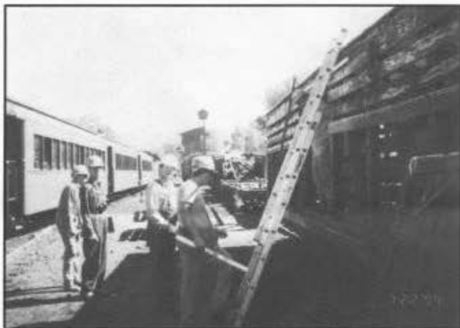
Crew working on the installation of a new roof using historic materials for stock car no. 5691, July 22, 1994.