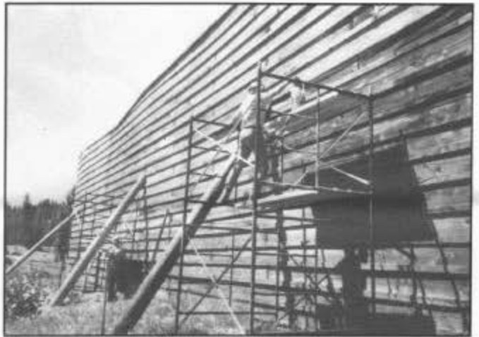
Final touches were put onto the remaining section of the Snowshed at Cumbres Pass. Here volunteers spray linseed oil to help preserve board and batten siding installed over the last five years, July 22, 1994.