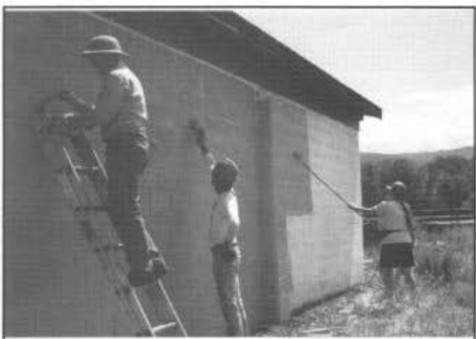
Volunteers painting the Friends Railroad History Center, July 20, 1994.