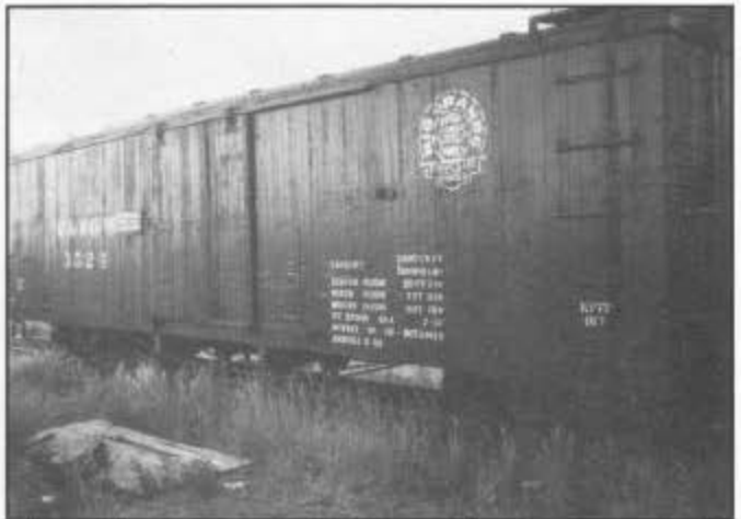
Display train boxcar no. 3524 which was painted in 1992 received its historic lettering, July 25, 1994.