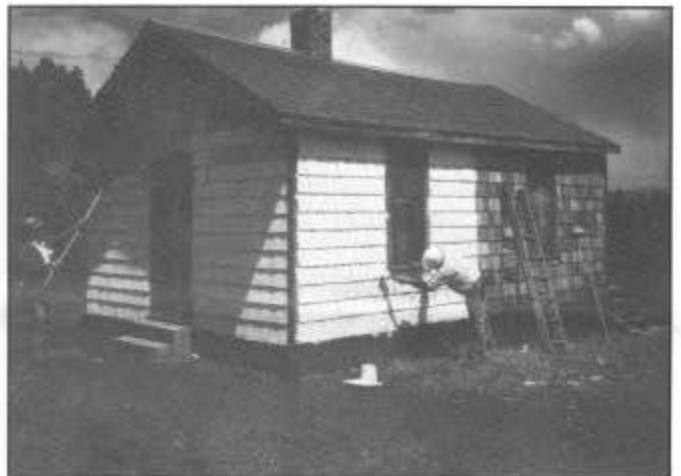
Volunteers starting the job of painting the shingle bunkhouse on the eastern edge of Sublette on the first day of the work session, July 20, 1994.