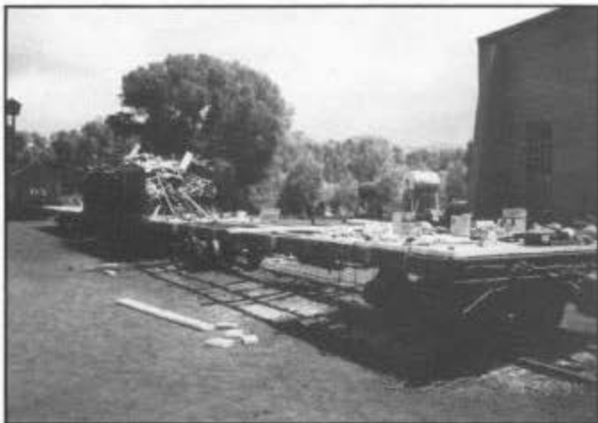
Work proceeding on steel flat car no. 601 with the decking approximately half completed, July 25, 1994.