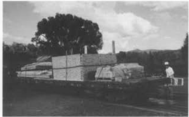
In the Chama yard a flat car is loaded with materials for the projects at Cumbres and Osier. The box contains bags of concrete mix for Osier. The loading and unloading crews were hard at work both before and after the work sessions, seeing to it that materials were on hand for the volunteers and that equipment and materials were returned to Chama for storage after the sessions.