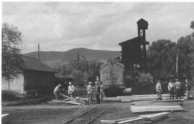
The loading crew sorting lumber in the Chama yard for the Cumbres and Osier projects.