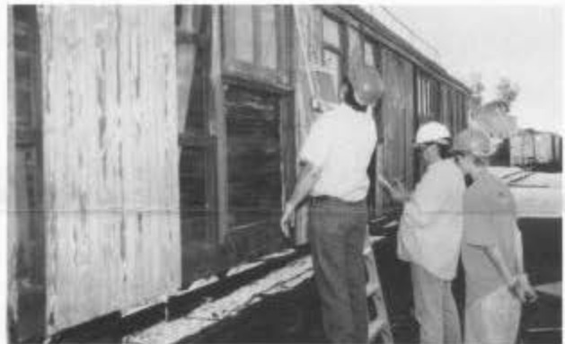
At the first session, from left, James Sutherland, Tony Kassin, and Craig Sutherland inspect cook car (former Railway Post Office car) 053 parked in Chama. Having done an inspection of the exterior in 1996, they needed to know more about the structural condition under the siding. The siding was removed at two-foot intervals, revealing a 112-year-old car in very good shape. Windows were removed to get a detailed picture of the frames that will need to be replaced, and plans were made to replace the eighteen screen frames in the clerestory roof. The roof was inspected and found to be in very good condition.