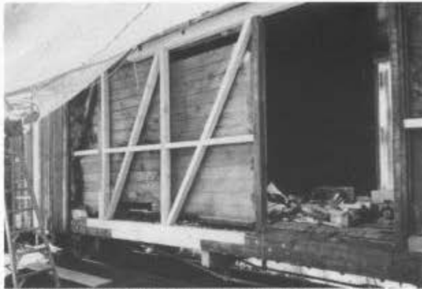
Refrigerator car 157 with new sections of header and outside main sill and new uprights and diagonal braces.