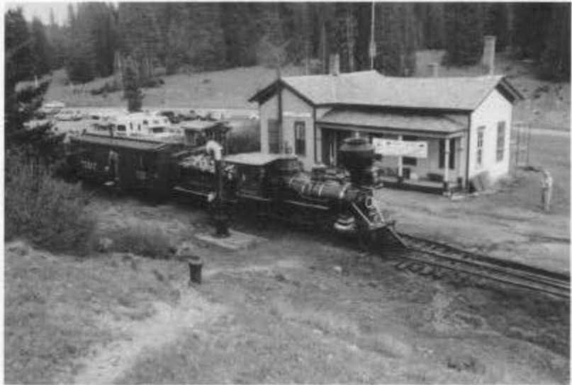
The Eureka pauses for water at the Cumbres standpipe on June 19, 1997, on its way to Chama. A Baldwin 4-4-0 built in 1875, the wood-burning locomotive was originally Eureka & Palisades Railroad no. 4. On June 21 the Friends' fifth annual Railfan Photo Freight followed the Eureka on its run from Chama to Osier and return. The enthusiastic railfans had many photo opportunities during the day. The Friends' banner is displayed on the section house.

http://ourworld.compuserve.com/homepages/drichter/focts.htm