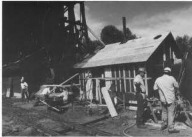
The sand house in the Chama yard with the new plywood roof sheeting, siding, and battens.