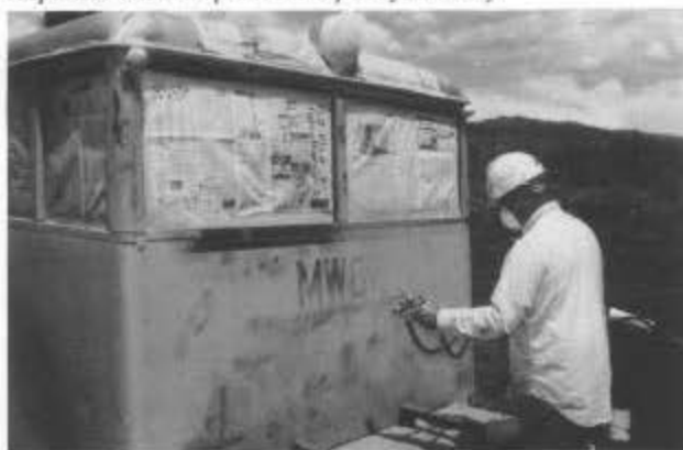
Kevin Bruce sprays inspection car MW02 with primer in the Chama yard. Work started last year was continued. The volunteer crew replaced rear brake shoes and freed and adjusted the rear brake linkage. To improve engine cooling, a duct between the radiator and the body was installed along with a rebuilt fan shroud. Other work included upgrading elements of the fuel system, repairing a leak in the final drive for the rear axle, and installing new interior door panels. The car was also driven on a test run.