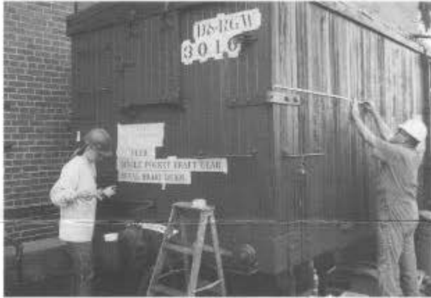
Robin Kumler and Dick Caldwell apply stencils to boxcar 3016, the Friends tool car, in preparation for lettering the car (session B).

Coal is loaded into 489's tender at the Chama coal tipple on the last day of session A as the crew demonstrates the newly operational hoist buckets. When first built, the tipple's hoppers were driven by a one-cylinder Fairbanks-Morse diesel engine with cable drum. Beginning in 1998 the team had been working to make this engine operational and, following the tipple loading demonstration, it was started up. The team and the many onlookers cheered as it began running again.