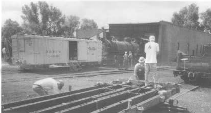
New end sill being installed on rail and tie car 06051. Parked in front of the old roundhouse are newly lettered outfit car 04549 and, awaiting major boiler work, engine 488 with lagging removed (session B). Below, restoration continues on the Osier section house (session A).