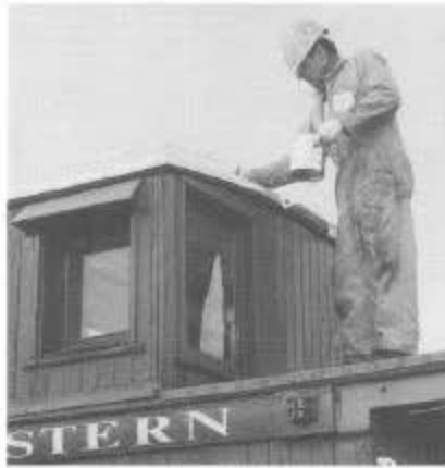
Jack Salisbury applies aluminum waterproof paint to the cupola of caboose 0503, an original D&RGW caboose (session A).