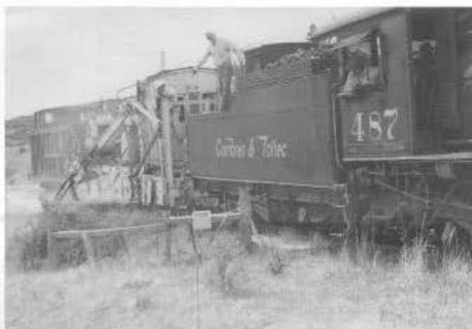
The Jordan spreader taking out weeds along the track, just east of the Highway 17 crossing below Coxo.

Along the way, we asked Marvin Casias, C&TS Road Foreman of Engines, to join our little sojourn down through the weeds toward the old sheep pen area of the Chama railyard. We cautiously approached the Jordan D&RGW #OU looking at it with critical eyes. She looked forlorn with faded gray paint and dry rot wooden