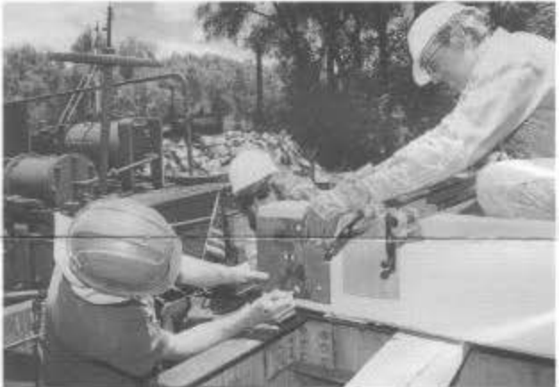
Jeff Smith marks where a hole will be drilled to hold the corner brace on flanger OJ, while Sherrie Rider and Terry Rider help hold the corner brace (session A).

–painted milepost 322, reset milepost 341, painted 6 whistleboards, 3 yard limit signs, and the Lobato sign during session A. During session B, the volunteers: