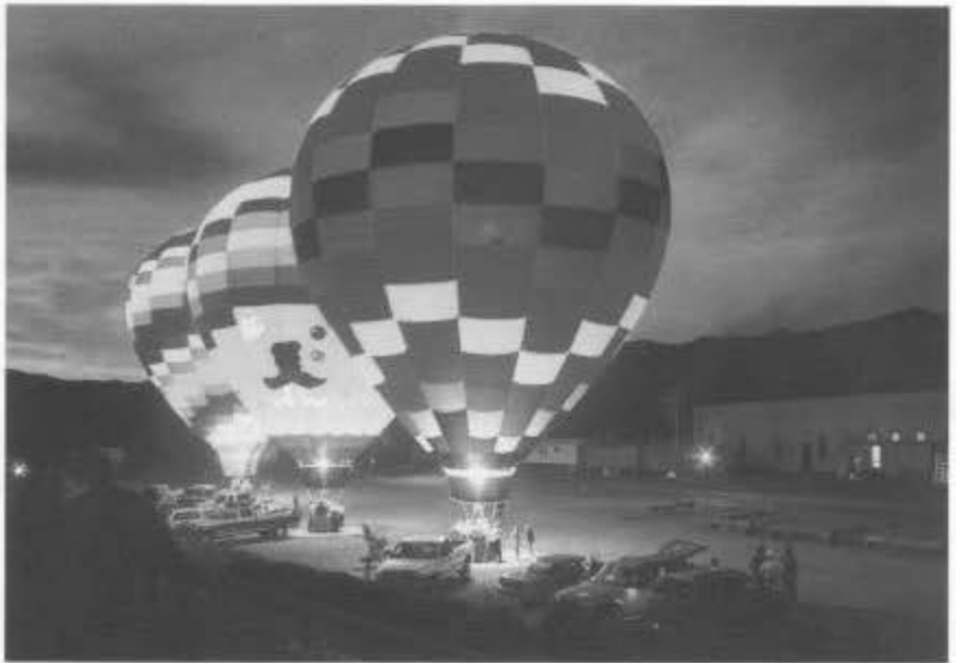
Balloon glow in the Chama yard the evening of the "Grand Opening" of the Cumbres & Toltec Scenic Railroad, June 16, 2000.

Visit the Friends on the Web: http://CTSFriends.railfan.net