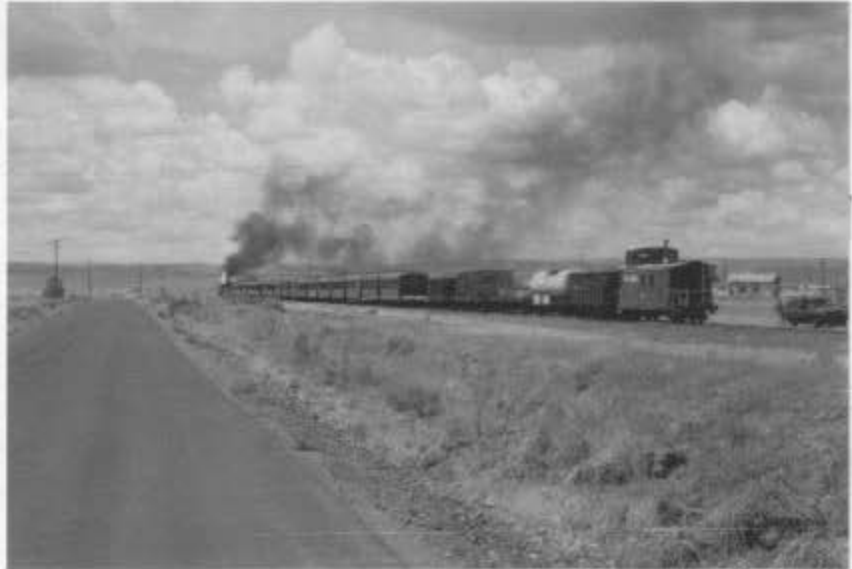
Locomotives 497, 487, passenger cars, and a work train heading west out of Antonito for Chama on Monday, May 20, 2002, in anticipation of the opening day on May 25. A modified schedule had trains originating and terminating in Chama until the railbed enhancement work needed at two locations was completed. The consist was 19 coaches, 2 water tankers, 2 flat cars with gravel and ties, an empty flat car, 2 hopper cars, and caboose 0503.