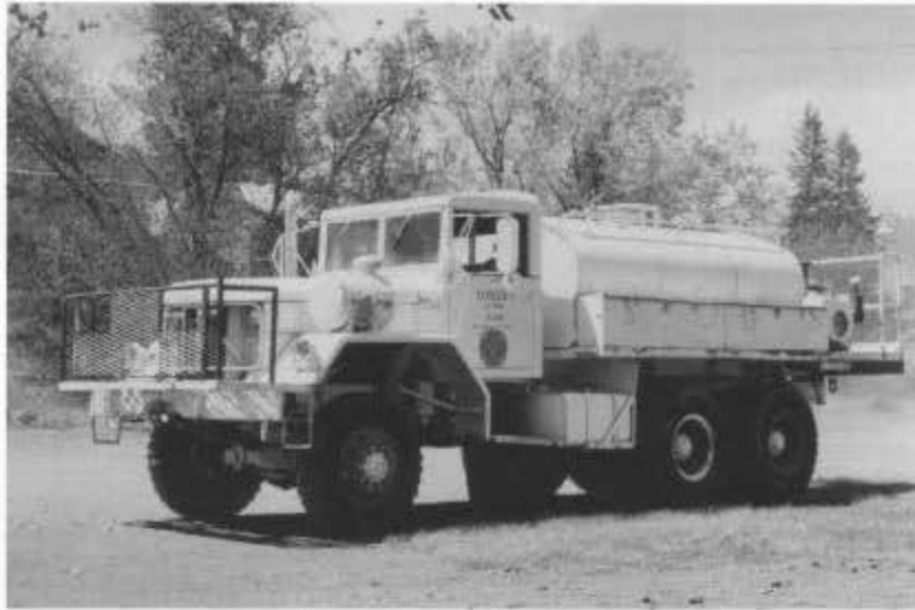
The new fire truck for the C&TS, before its coat of red paint. Four and one-half-ton, with six-wheel drive, the truck can "go anywhere" to put out fires (May 2002).